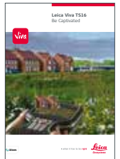
Leica Viva TS16