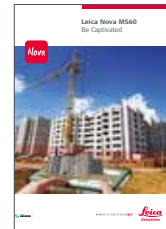
Leica Nova MS60