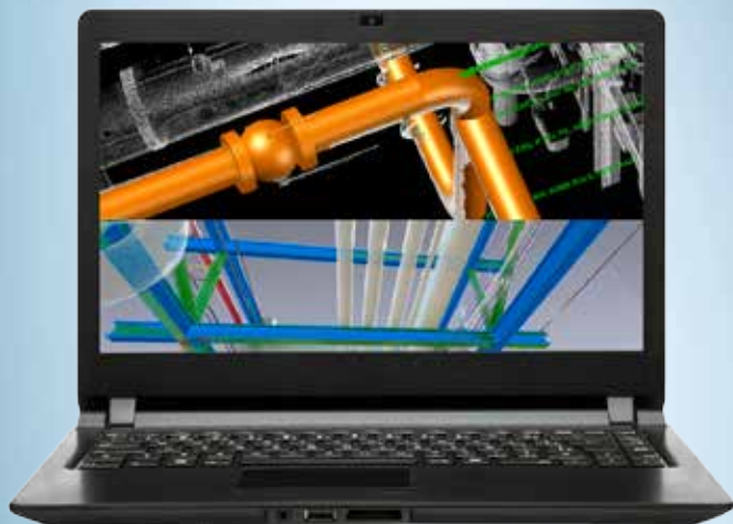
Reverse engineered piping system Type recognition and best-fit of steel members